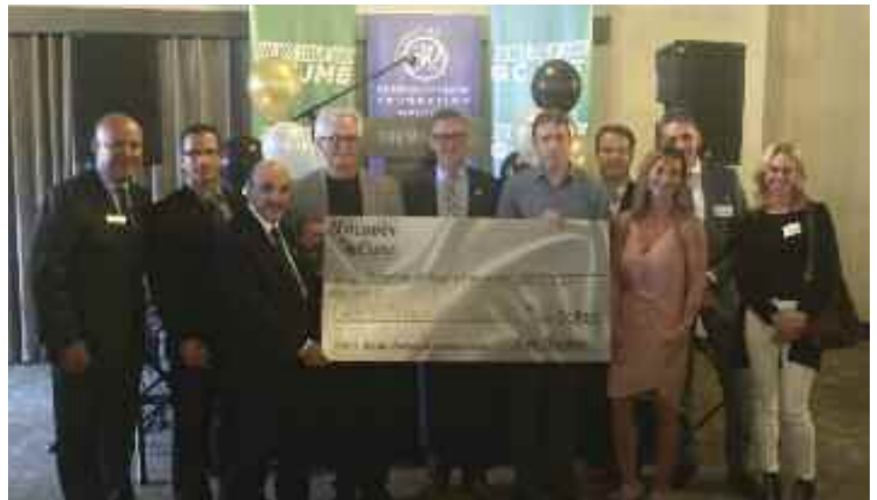
Uncover the Cure celebrated its 10-year anniversary by raising nearly $83,000, bringing its 10-year total to more than $1 million.