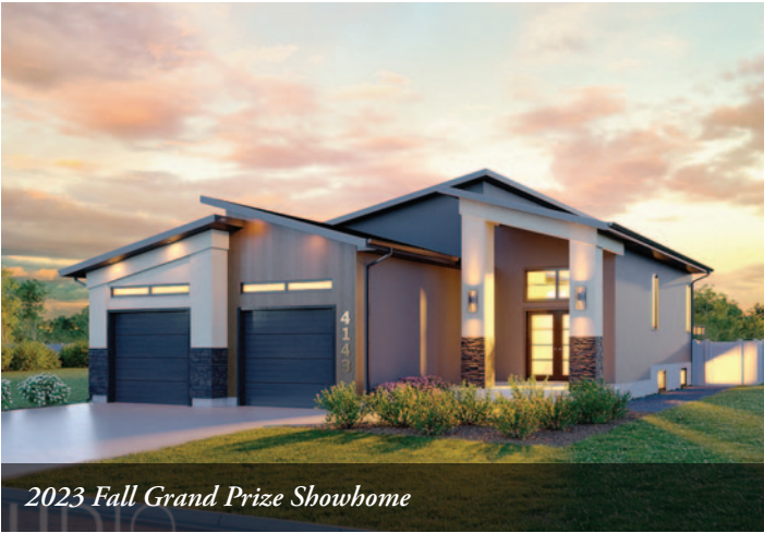
2023 Fall Grand Prize Showhome