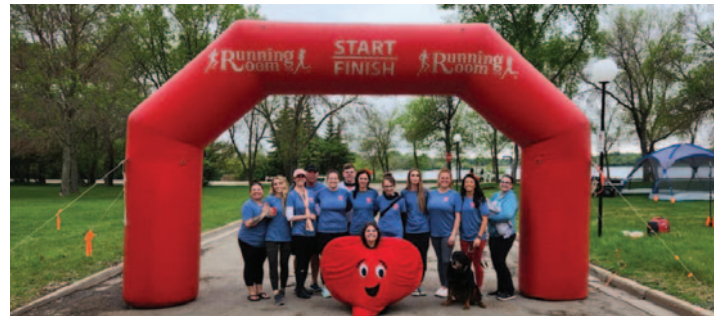
Cardiac Care 5K Walk/Run team

The picturesque orchards at Over The Hill Orchards and Winery were the backdrop for the Ladybug Picnic & Paint Event on August 26 th , in