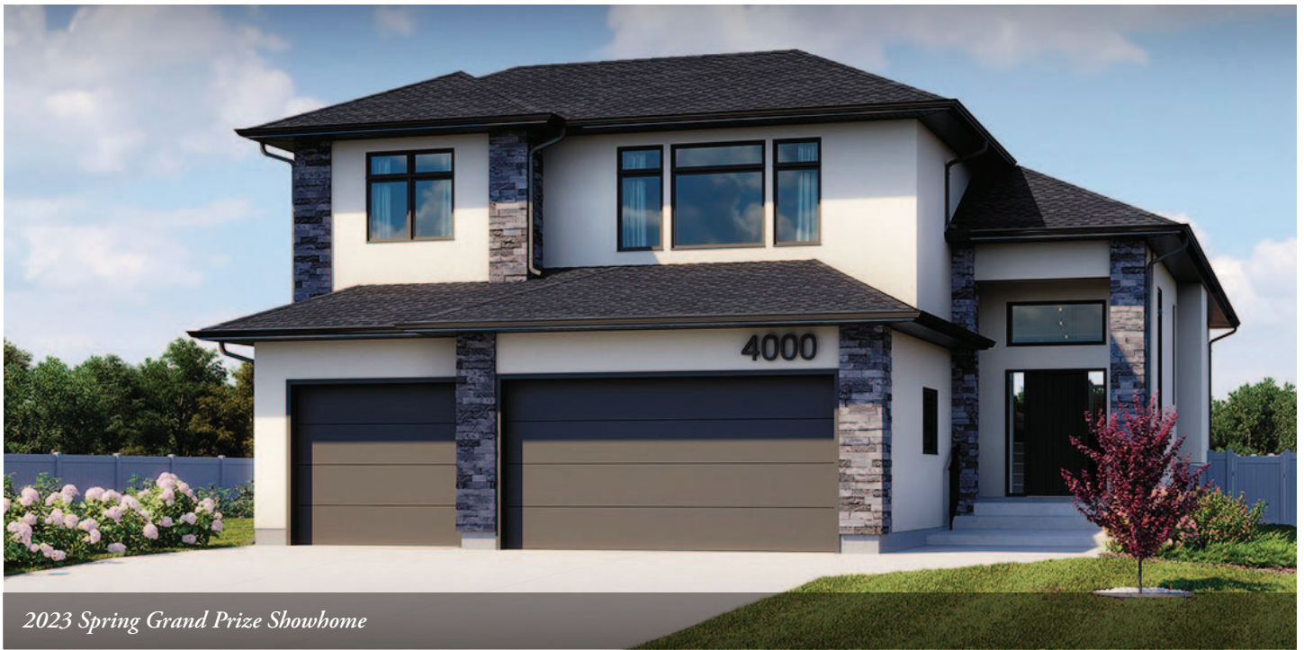
2023 Spring Grand Prize Showhome

SINCE 1987, OUR HOME LOTTERY PROGRAM HAS RAISED MORE THAN $55 MILLION FOR REGINA'S THREE HOSPITALS, FUNDING CRITICAL MEDICAL TECHNOLOGY, RESEARCH AND HEALTHCARE EDUCATIONAL PROGRAMS THAT BENEFIT US ALL.