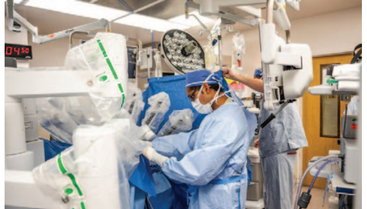
Regina surgeon operating in one of our twenty surgical suites

This multi-year renovation and technology upgrade project was completed in 2023. All operating rooms received lighting upgrades, and the 30 year-old surgical booms were replaced. The newly installed surgical lights and booms not only ensure safer use of medical gases such as anesthesia, nitrogen, oxygen, and carbon dioxide but also optimize the positioning of essential equipment, including surgical monitors and audio-visual data devices. This improved setup and use of space greatly benefits Regina's surgical teams, allowing them to focus on patient care with enhanced precision, safety and effectiveness, during an operation. These upgrades, totaling twenty upgraded operating rooms, signify a