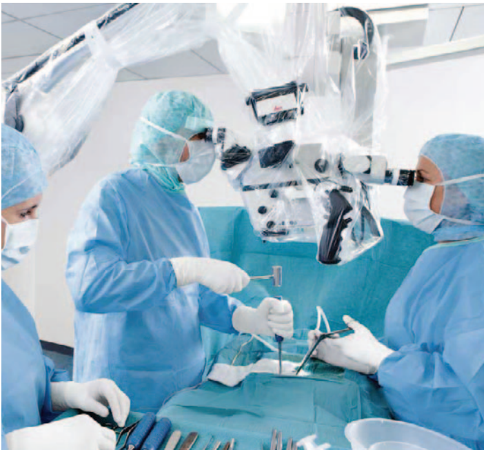
A neurosurgical microscope in use