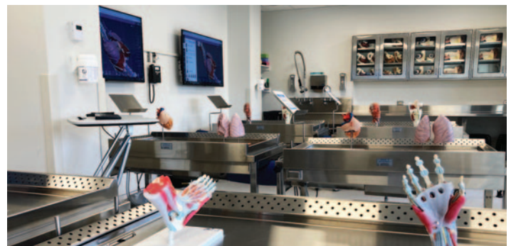
New Anatomy Lab at the College of Medicine Regina Campus