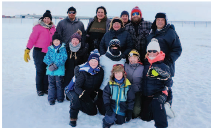
Pure Country 92.7 Snow-Pitch tournament team