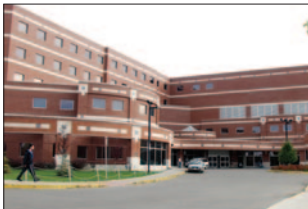
REGINA GENERAL HOSPITAL