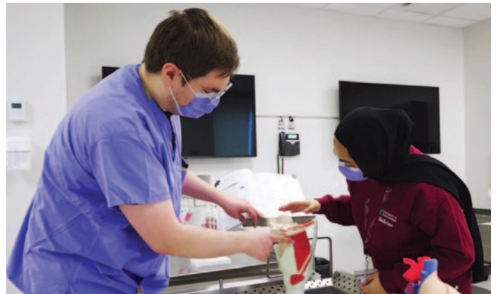
Students training at the College of Medicine Regina Campus

"We know that training future doctors is more important than ever, and we are grateful to