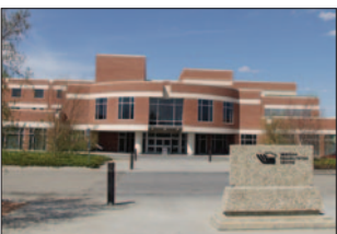
WASCANA REHABILITATION CENTRE

O n behalf of the Saskatchewan Health Authority (SHA), I would like to extend my sincere gratitude to Hospitals of Regina Foundation for its continued support in the provision of high-quality and timely care in Regina and throughout southern Saskatchewan. It is through the generosity of your donors that we are able to work towards achieving our vision of Healthy People, Healthy Saskatchewan .