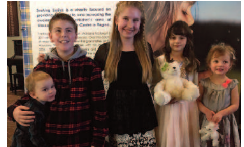
Teddy Bear Tea: $19,000