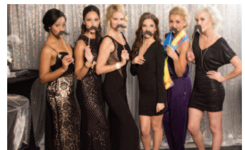
The Moustache Bash: $25,000