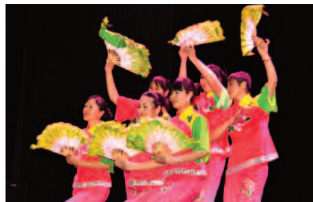
Chinese New Year: $10,870