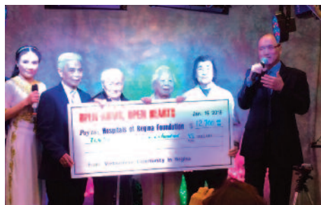
Open Arms, Open Hearts: $15,900

INTERESTED IN HOSTING YOUR OWN FUNDRAISER? CONTACT US TODAY: HRF@HRF.SK.CA OR 306.781.7500