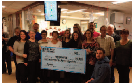
Bethune Relay for Life Teams: $22,000

*Some events held in support of Hospitals of Regina Foundation between September 2015 and April 2016 are featured here.