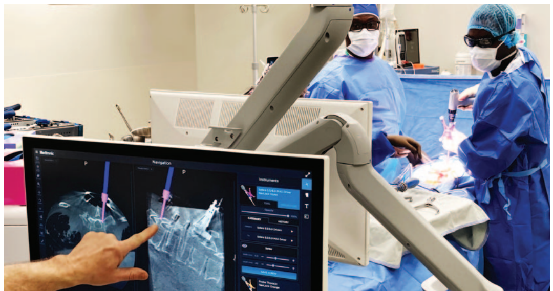
S8 Surgical Navigation System in use in a Regina General Hospital operating room