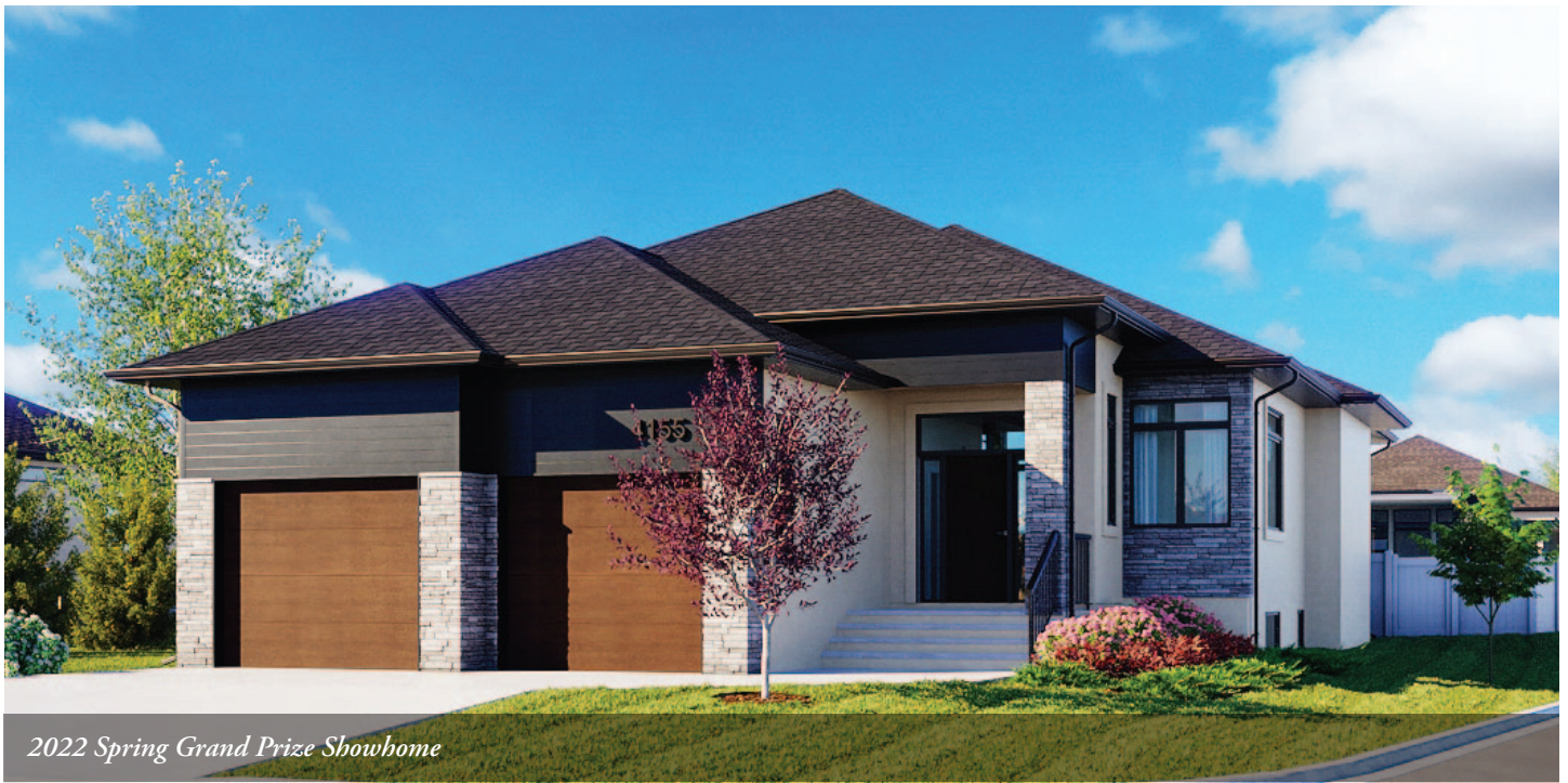
2022 Spring Grand Prize Showhome

SINCE 1987, OUR HOME LOTTERY PROGRAM HAS RAISED MORE THAN $55 MILLION FOR REGINA'S THREE HOSPITALS, FUNDING CRITICAL MEDICAL EQUIPMENT AND TECHNOLOGY, RESEARCH AND EDUCATIONAL PROGRAMS THAT BENEFIT OUR COMMUNITY.