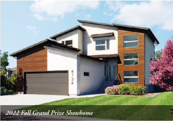
2022 Fall Grand Prize Showhome