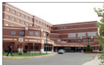
REGINA GENERAL HOSPITAL