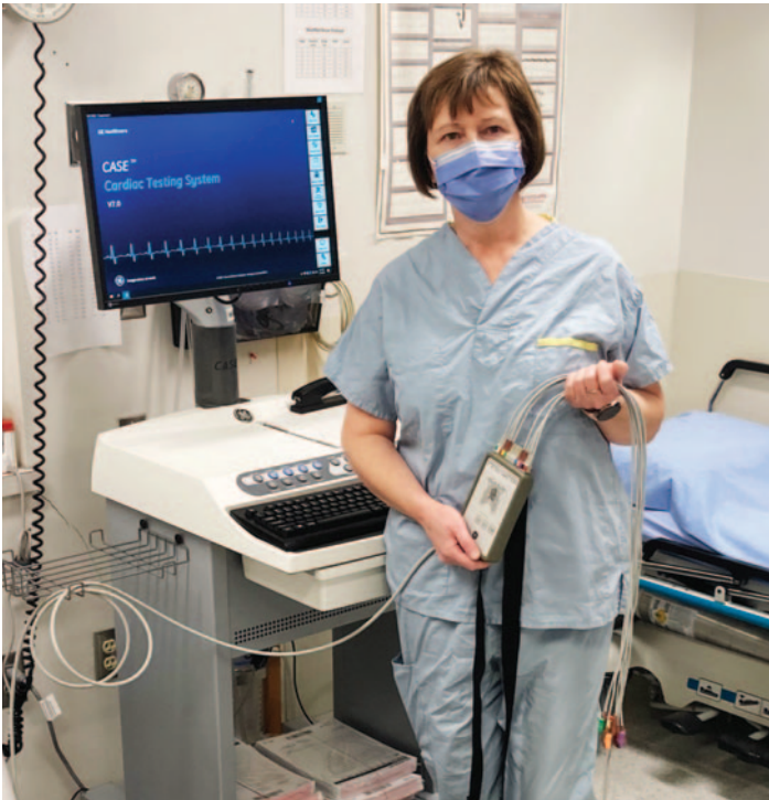
A nurse in Regina's Cardiac Care Unit displaying some of the upgraded cardiac care equipment

Our Mosaic Heart Centre, at Regina's General Hospital, is a provincial cardiac centre of excellence. Last year alone, thousands of cardiac procedures were completed here. More than 300 people needed open heart surgery, 2,310 patients needed interventional procedures such as angioplasty or the insertion of a stent, and 503 patients received pacemakers to address irregular heart rhythms. An additional 53 people benefitted from an advanced and minimally invasive procedure called a transcatheter aortic valve implantation (TAVI) to replace their damaged aortic valves.