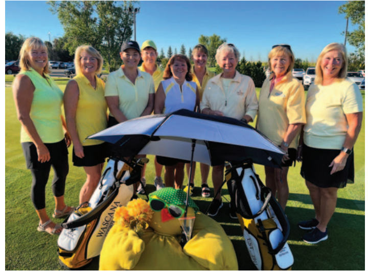
The Chick-A-Dee Golf Tournament organizing committee

We owe many thanks to the fantastic volunteer committee which organized and hosted Motorcycle Ride for the Boys on July 9th. This exciting poker