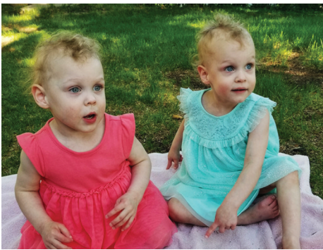
The twins THEN (above) and NOW (below)