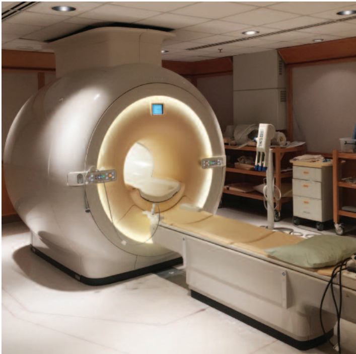
Refurbished MRI machine at Regina General Hospital

Medical imaging is a vital part of health care, and every year, thousands of people across southern Saskatchewan need it to diagnose and treat diseases and injuries. Powerful imaging technology, like computerized tomography (CT) scans, magnetic resonance imaging (MRI) scans, X-rays and ultrasounds, can help assess a brain injury, perform localized chemotherapy and screen for cancer, among countless other uses.