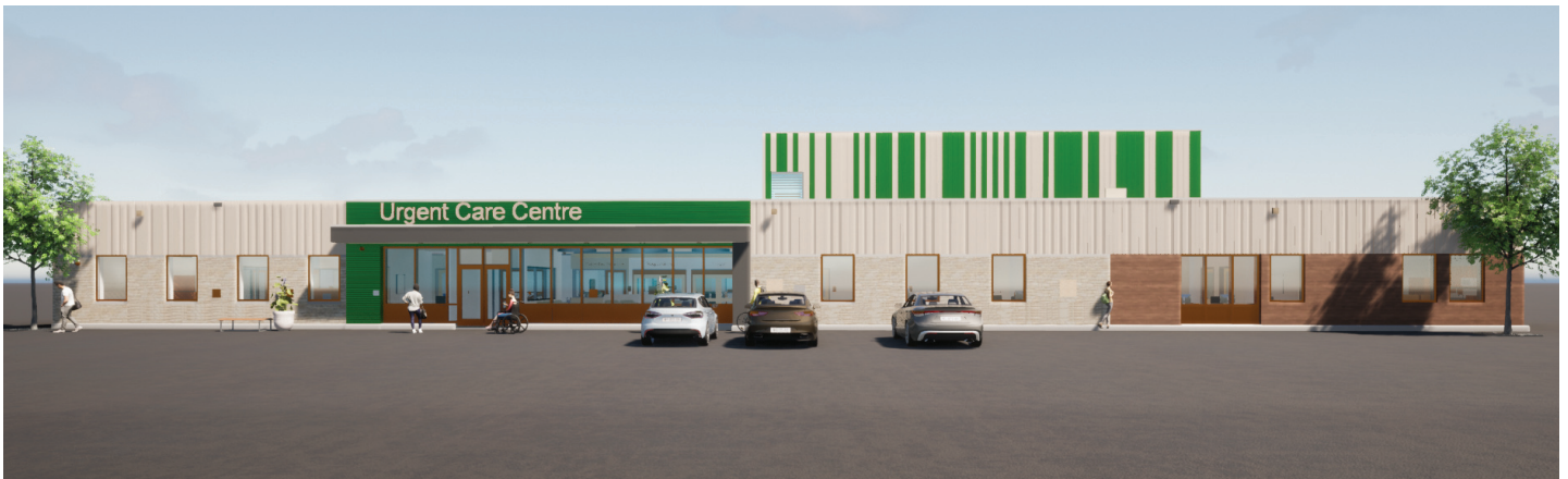
New Regina Urgent Care Centre

In a groundbreaking move that will redefine health care accessibility in Regina, the impending completion and opening of the brand new Regina Urgent Care Centre, on Albert Street North, is set to provide a significant boost to our health care system.