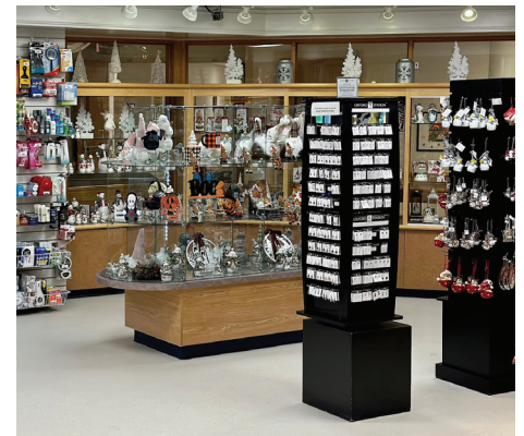
Regina General Hospital Gift Shop

"The Foundation is very excited to take on the operation of the Regina General