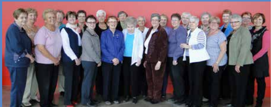
Pasqua Hospital Auxiliary