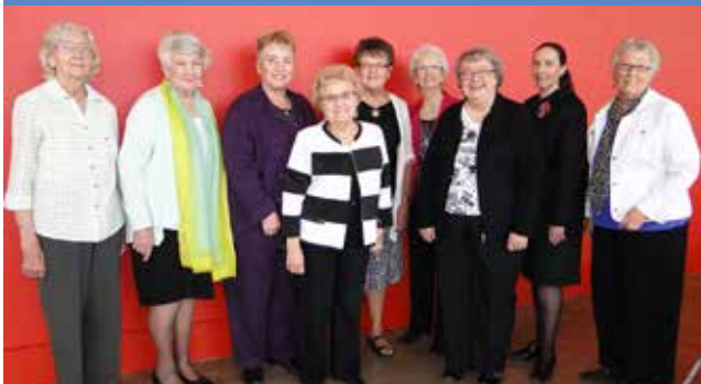
Regina General Hospital Auxiliary

The Auxiliaries dedicate thousands of volunteer hours each year in support of raising funds for equipment in their hospitals. The Auxiliaries have raised more than $6 million over the past 30 years through the hospital gift shops, raffles and used book sales!