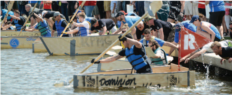
Participants during Plywood Cup on July 1, 2018

Every year, thousands of people cheer as more than a dozen plywood boats race across Wascana Lake. As the makeshift boats battle it out, many sink while others miraculously triumph until one is declared the champion.